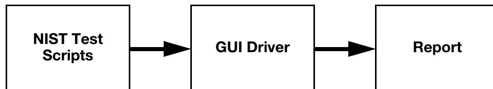
Figure 3: NIST Testing Framework

The GUI driver script ( RunNISTTests.jsl ) can reside anywhere in your file system. The NIST test scripts and associated data tables must reside in a subdirectory, named tests/NIST/ , of the directory where the driver script is located. In addition, to be recognized by the driver, test scripts use a prefix of test (for example, testMavro.jsl ).